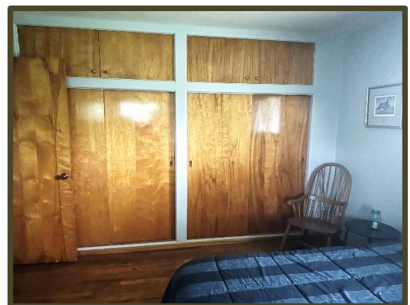
with dual storage closets in each one.