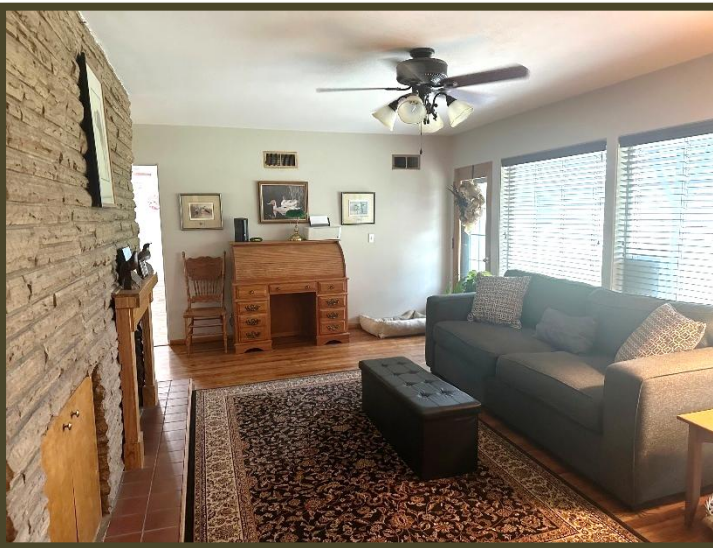
A family room is also on the main floor with a brick fireplace.