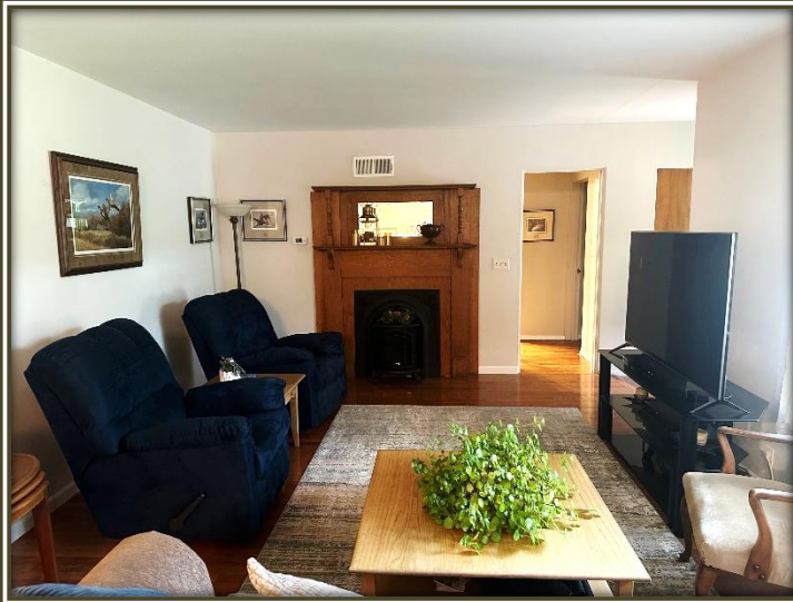
Front living room (left) and the combo dining room.