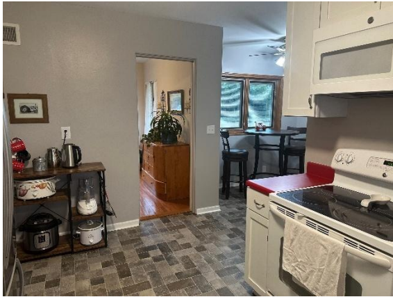
Kitchen with small dining area. Kitchen appliances included.